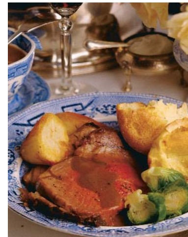
Brussels sprouts add a touch of green, but roast beef takes center stage in this hearty winter meal.

Anne Willan is the founder and president of L'Ecole de Cuisine La Varenne in Burgundy, France, and La Varenne at The Greenbrier in West Virginia. She has written more than 30 cookbooks. ◆