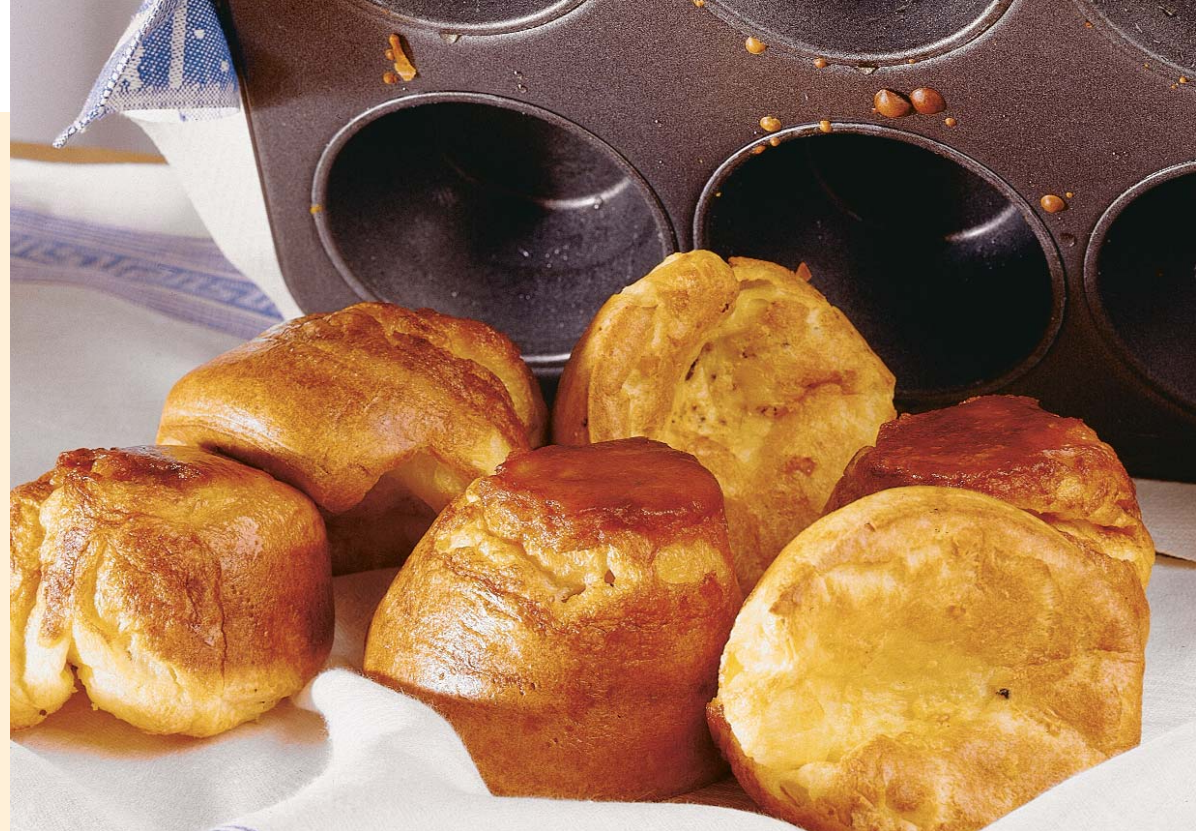
Crisp, savory Yorkshire pudding has the best texture when made in large muffin tins.

Horseradish sauce adds piquancy to the plate. To make an English horseradish sauce, grate a heaping tablespoon of fresh horseradish root. Whisk a